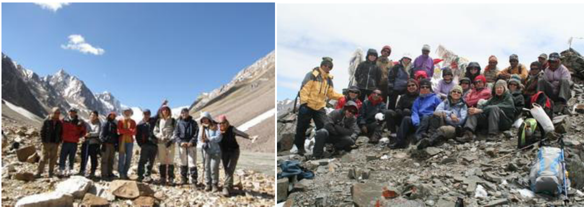
Group 2008 & 2011 Climbing Bhapa Pass

Day 4 Manali - We drive to Solang Valley for paragliding. This recommended activity is optional and members will have fly tandem i.e. with an accompanying pilot. We walk back to Manali through picturesque villages and orchards of apples, apricots and peaches. Manali is mainly Hindu with a sizeable Tibetan population. O/N Manali.