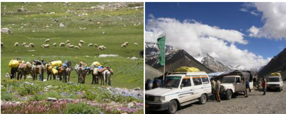
Packed horses for trek / Jeep

Day 7 Kaza-Ki Monastery-Kibber Village-Mud - Visit by jeeps the Ki Monastery located on a small hill followed by Kibber Village 4205m, reputed to be the 2nd highest inhabitable village in the world. After lunch we then enter the Pin Valley and to the village of Mud. Here, we do a short 2 km trek to our campsite across from Mud. O/N Camping.