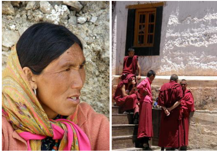
Local Women / Monks at Monastery

there is a repeat of a similar cold front, expect the trip to be postponed to perhaps between one to two weeks later. In Jun 2007 & 2008 our group has no such problems and trip proceeded smoothly.