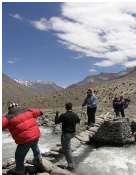
Trek the Bhapa Pass on snow / River crossing

Day 11 Mooling-Kafnu-Shimla - Another easy day with 5 hours level walk to the village of Kafnu. Trek is flanked by green meadows and thick pine forest. Expect to arrive by 1pm, group can have good lunch/rest after few days long trek. It takes about 6 hours ride to Shimla. Evening free & easy. O/N Shimla.