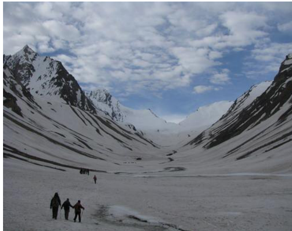
Bhapa Pass trek 2008 & 2011

Annually, travellers visiting this far-flung corner of the Indo-Tibetan frontier region of India, barely hits five figures, a major reason being access to Spiti is only for 6 months in a year! Discover a face of India seldom seen; in age-old Gompas devoid of mass tourism a la Potala(!), ancient mountain hugging villages, and a ruggedly beautiful Himalayan landscape. Then after all that culture, its time to get high on mother nature on a tough but rewarding 5 day trek across the 4900m Bhapa Pass—a true voyage of self-discovery we assure you!